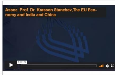
EU Trade and Investment in historic and contemporary perspective

EURASIA Thematic Area: International relations